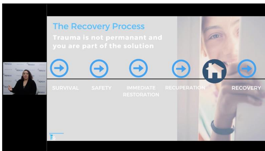
SCREENSHOT OF WEBINAR

https://register.gotowebinar.com/recording/6874575905163943427