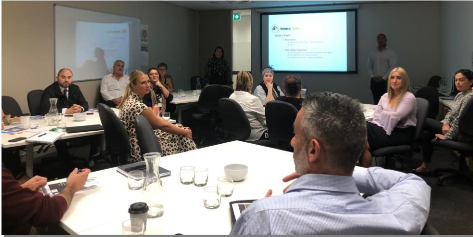
ABOVE AND RIGHT: FACE-TO-FACE TRAINING